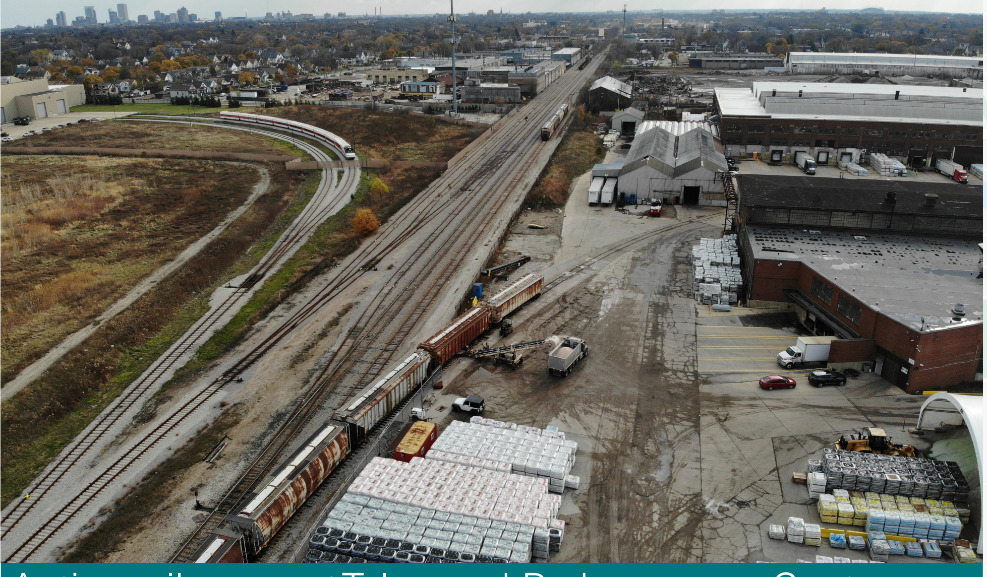
Active rail spurs at Talgo and Parkway near Century City Business Park (looking south) Vía de servicio ferroviario activa en Talgo y Parkway cerca del Century City Business Park (mirando hacia el sur)