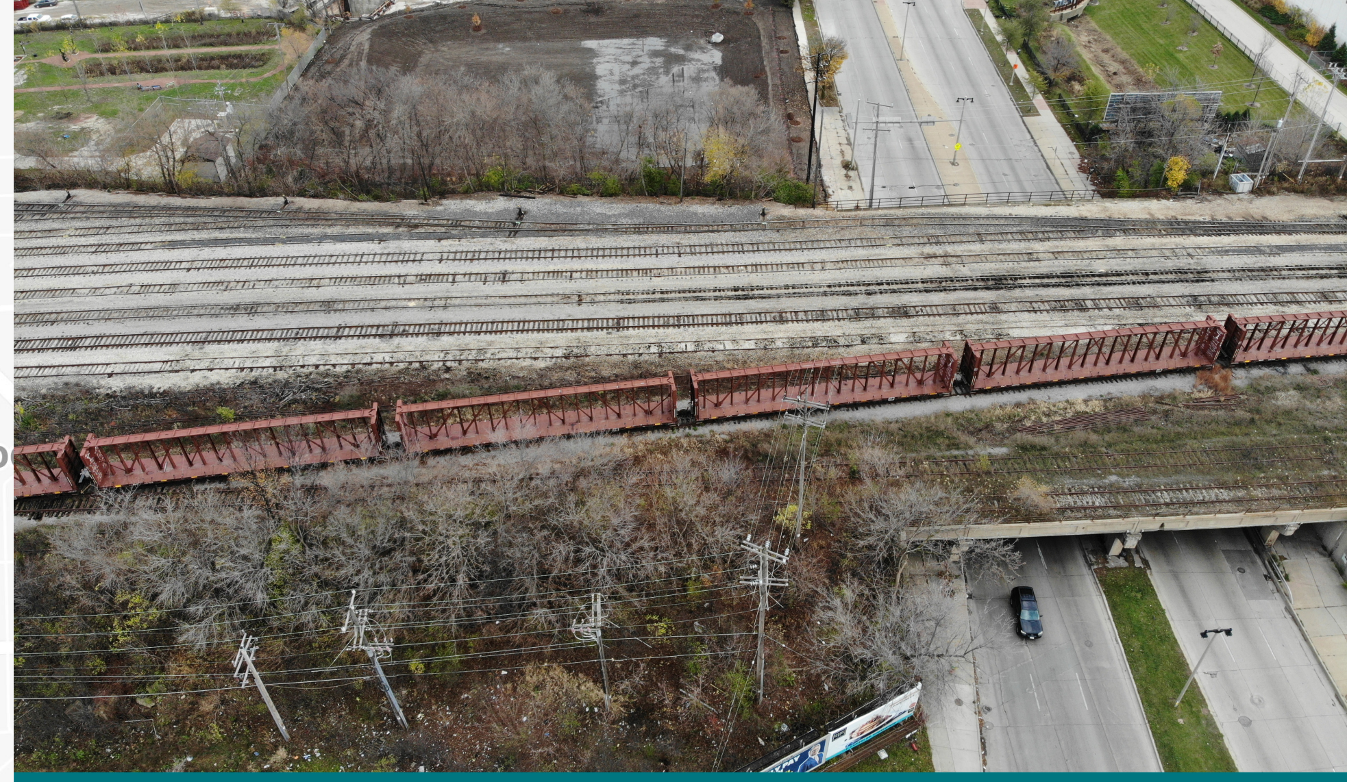
Railroad bridge over W. Capitol Drive (looking east) Puente ferroviario sobre el oeste del corredor Capitol Drive (mirando hacia el este)