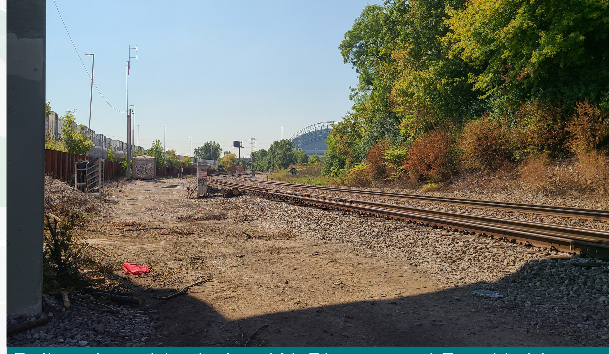
Railroad corridor below W. Bluemound Road bridge (looking south) Corredor ferroviario debajo del puente al oeste de Bluemound Road (mirando hacia el sur)