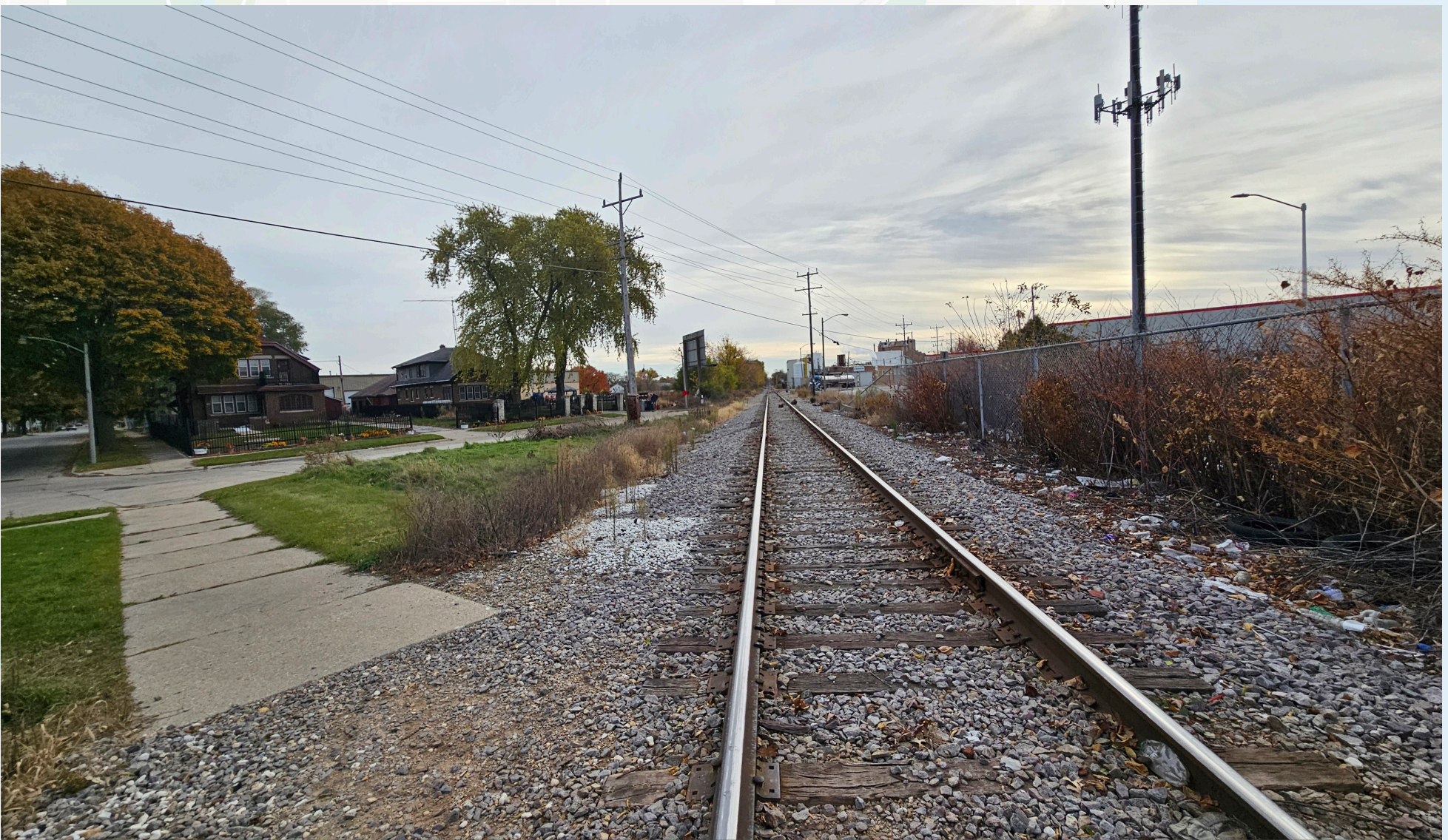
Rail corridor near W. Custer Street (looking south) Corredor ferroviario cerca al oeste de la calle Custer (mirando hacia el sur)