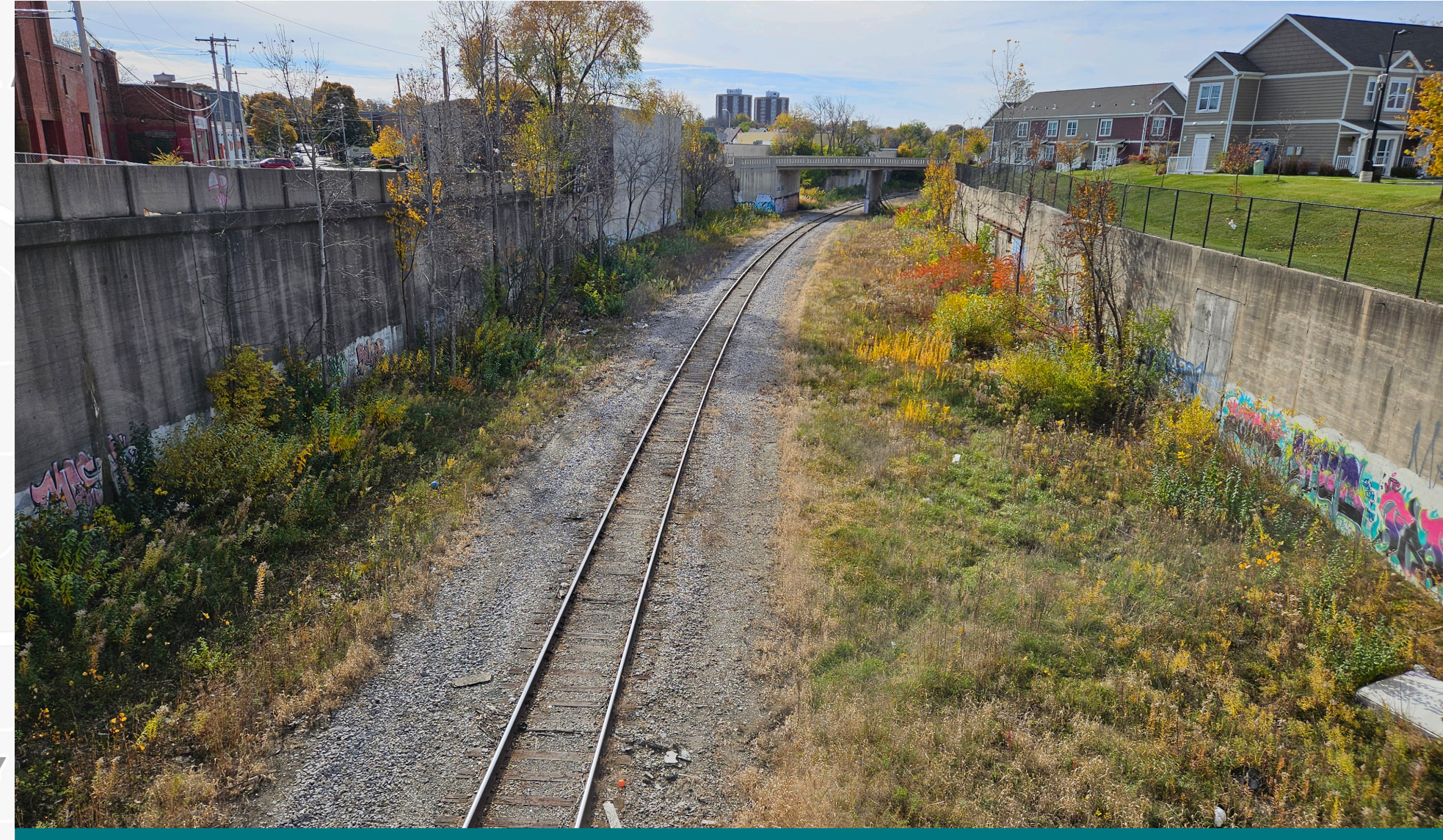
Railroad corridor from W. Galena Street bridge (looking south) Corredor ferroviario desde el puente oeste de la calle Galena (mirando hacia el sur)