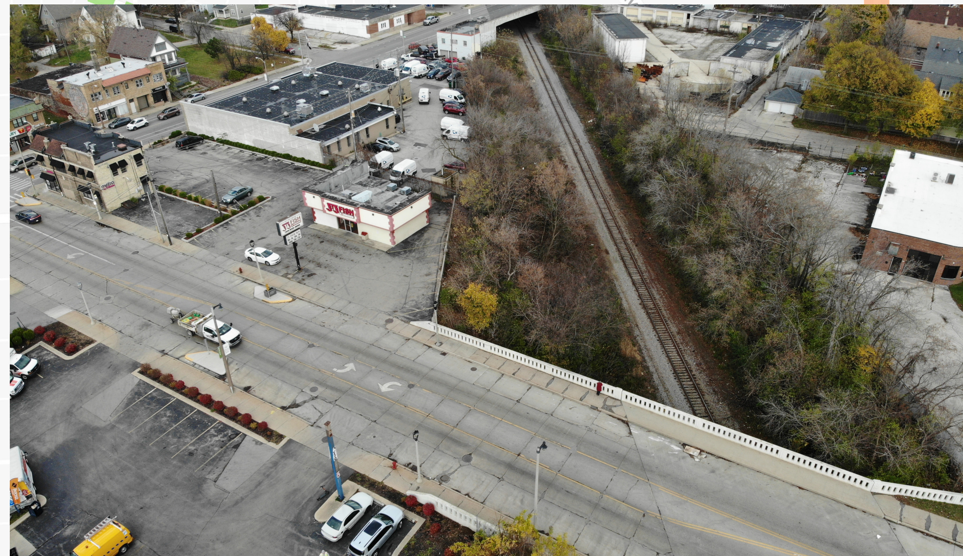
N. 35th Street is on the High Injury Network La calle 35 Norte está en la red de alta incidencia de lesiones