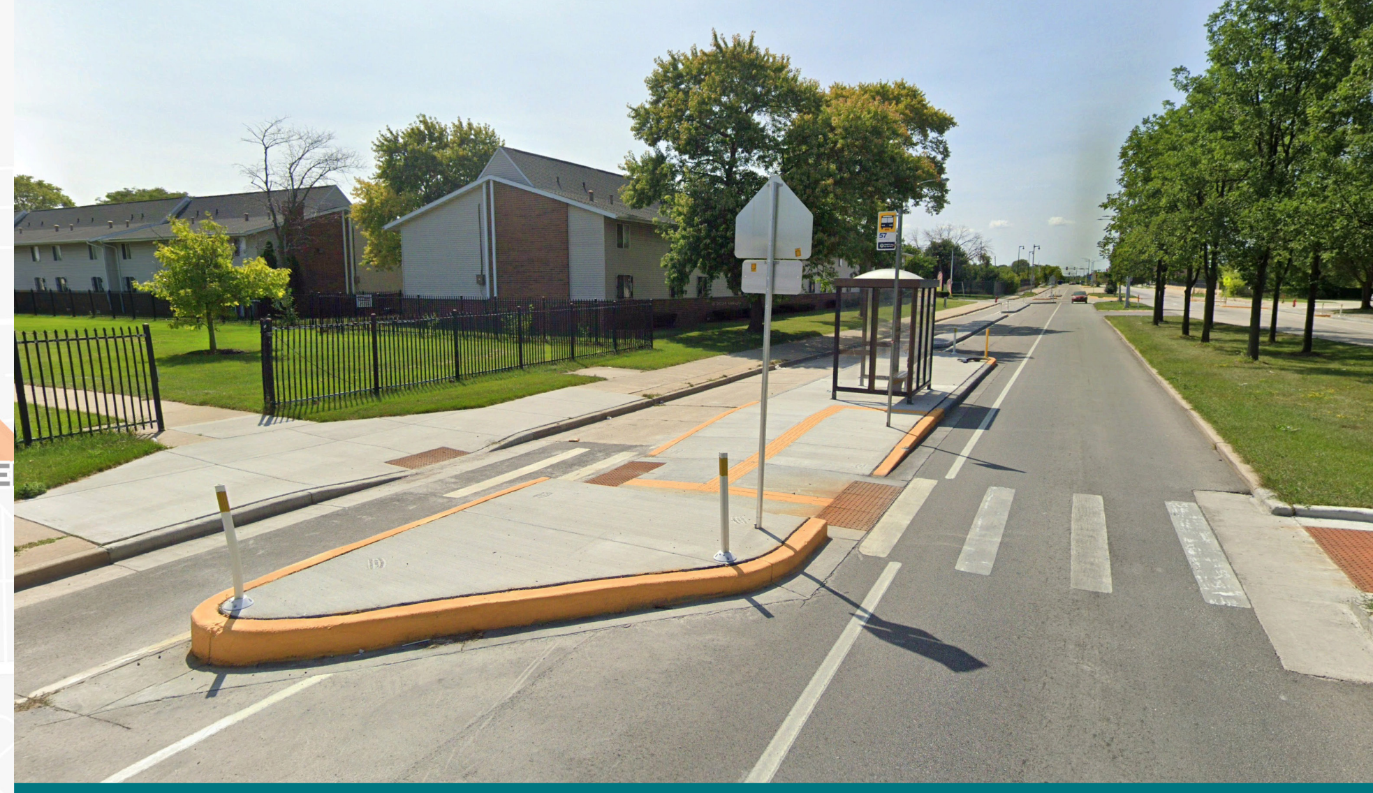
Example of protected bikeway on W. Walnut Street Ejemplo de ciclovía protegida en la calle W. Walnut