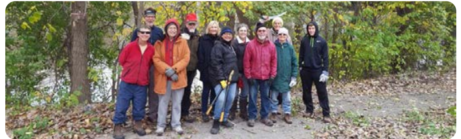
THE PARK PEOPLE OF MILWAUKEE COUNTY, INC.

If you did not see your Park on our list of Friends Groups, you might be interested in establishing a new group. The Park People has more information on starting a Friends Group, but in summary, the process looks like this: