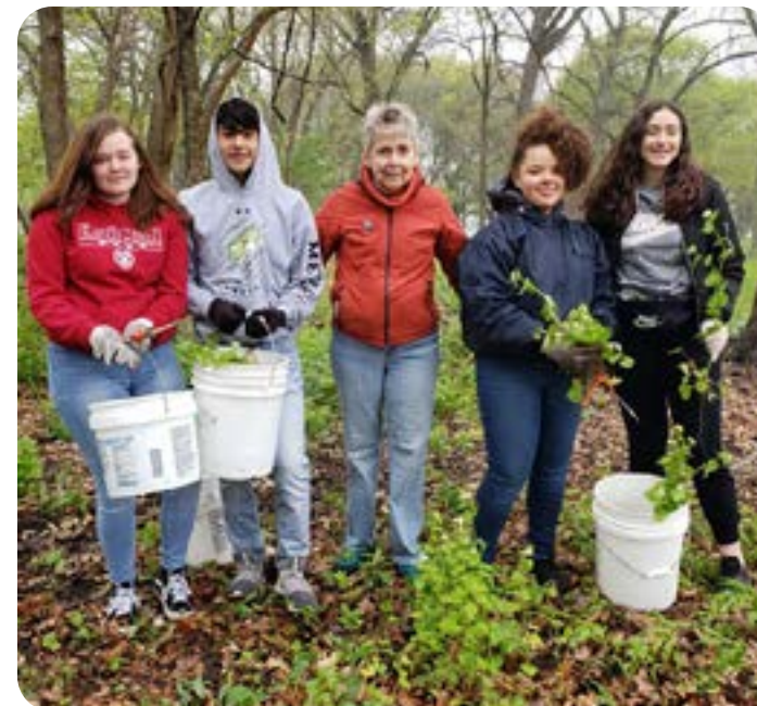
THE FRIENDS OF LINCOLN PARK

The Park People offers the valuable service of providing fiscal sponsorship to Friends Groups, allowing Friends Groups to function more efficiently. Based on Milwaukee County Parks' observations of Friends Groups over the years, we recommend new Friends Groups establish themselves as a "Fiscally Sponsored Friends Group" for at least a few years while they work to build capacity, accomplish projects, and solidify themselves as a Friends Group. The administrative burden of starting a new 501(c)(3) organization and maintaining that status can sometimes cause new groups to dissolve before they ever get started. While fiscal sponsorship comes with a small cost, we find the benefits outweigh the costs. Your group can always secure 501(c)(3) status in the future.