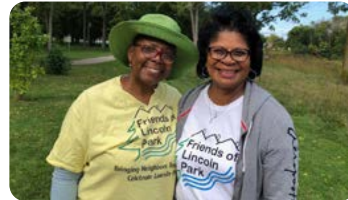
THE FRIENDS OF LINCOLN PARK

In 2010 several community partners worked to develop the Milwaukee River Greenway Master Plan, a vision for connecting recreational spaces along the Milwaukee River. One component of the plan included closing a gap between Lincoln and Estabrook Parks so that the two Parks would be accessible by a connecting trail. These two Friends Groups – with many community partners and volunteers! – worked tirelessly to dig the trail by hand through forest and prairie, meandering beneath highway infrastructure and along the shore of the Milwaukee River. The trail is open today and maintained by Friends Groups, community volunteers, and local organizations. The effort highlights the importance of Friends Groups in building and connecting communities in Milwaukee County, and is a perfect example of Friends Groups as the “hands” of our great Parks.