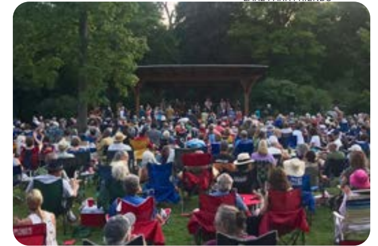
LAKE PARK FRIENDS

When several neighbors noticed that the Park across the street from their homes was largely unused, they decided to do something about it. Friends of Center Street Park is a group comprised mostly of parents from the surrounding neighborhood working to activate and improve Center Street Park. Each winter, the Friends Group secures sponsorship from local businesses to run a very popular outdoor skating rink used for hockey and open skating. The group shows that with a little dedication from the community, our Parks can be filled with activity year-round. A core group of volunteers work to set-up the ice rink each year in addition to hosting regular events and raising funds for projects at the Park. The group jokes – and it’s probably true! – that Center Street Park is busier in winter than in summer, and in Milwaukee, that is quite the feat!