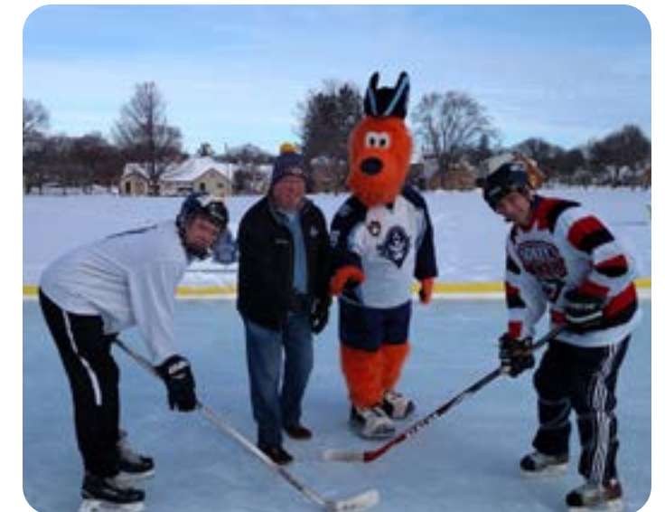
THE FRIENDS OF CENTER STREET PARK

In 1994 the community around Lake Park celebrated the Park’s centennial honoring the history of the Frederick Law Olmsted-designed Park. The celebration prompted the community to gather around the idea of starting a “friends of the park” group, and in 1996 Lake Park Friends was incorporated. The group has led many impressive efforts since they started, included fundraising for bridge restorations, maintaining natural areas, hosting summer-long concert series, providing regular cleaning and polishing of the Park’s monuments and statues, and volunteering to help maintain Park infrastructure such as sheds and trails. Their signature event, Cirque du Lake Park, raises thousands of dollars each year to support historical preservation projects throughout Lake Park.