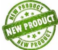
EMS: New Product/Procedure Request Form