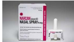
CQIP: Law Enforcement Narcan Administration