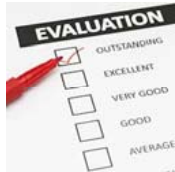
EMS: Onboarded EMS Provider Evaluation Form