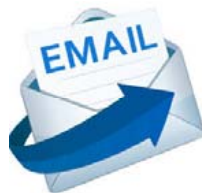
CQIP: Quality EMS E-Mail