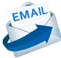
CQIP: Quality EMS E-Mail