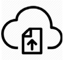
CQIP: Cardiac Arrest File Drop