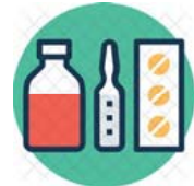
CQIP: Medication Extension Request Form