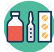
CQIP: Medication Extension Request Form