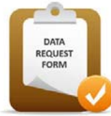
EMS: Data Request Form