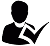
AHA: Course Roster