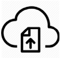
CQIP: Cardiac Arrest File Drop