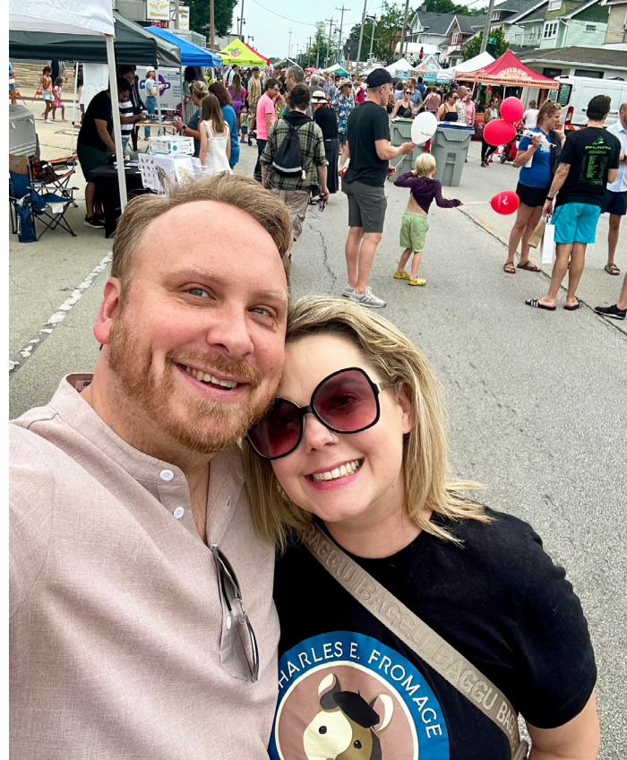
My wife and I love community festivals, especially Bastille Day West in Washington Heights!