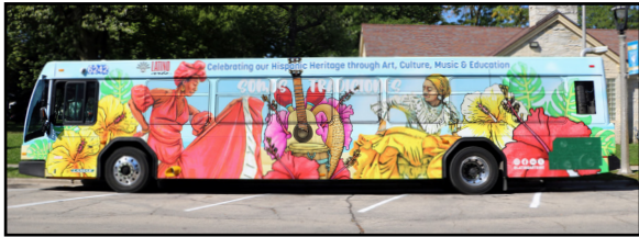
MCTS unveiled a new bus wrap in September recognizing Hispanic Heritage Month.

Due to the publishing deadline, I am unable to provide the final County Board modifications to the 2026 budget.