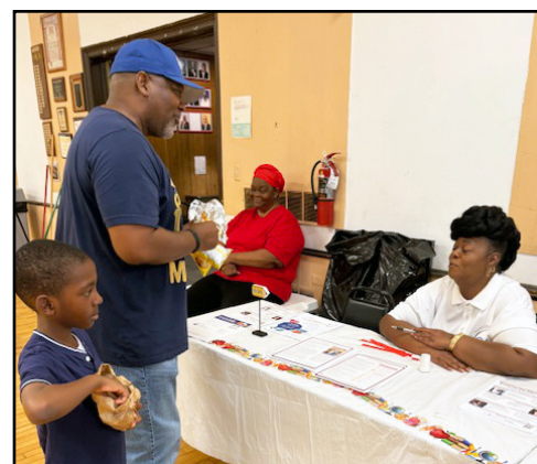
The OYAM Foundation participated in a 2025 "Back-to-School Giveaway" representing the Garden Homes Neighborhood.