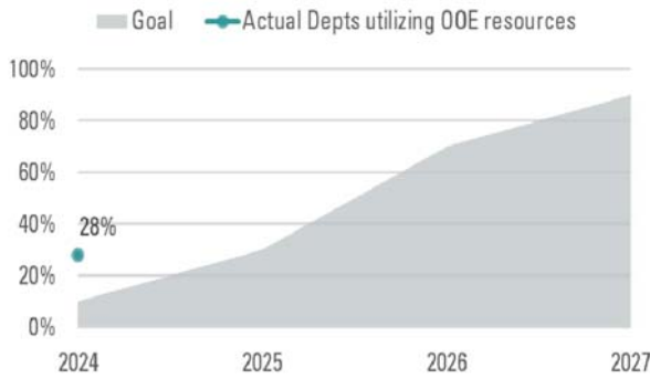
County departments' adoption of equity-centered tools and frameworks

The Office of Equity (OOE) will embed best-practice frameworks that address racism and advance equity by implementing the Community Engagement Program, Equity Practices Technical Assistance Program, and Community Engagement Connection Program.