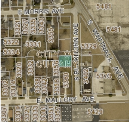
Parcel location within Milwaukee County