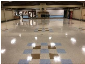
Wil-O-Way Grant (South Milwaukee)

Check out the Facility Guidelines & Facility Rentals Calendar .