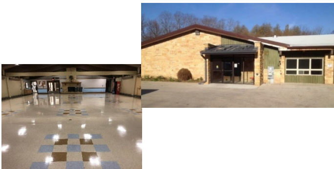
Wil-O-Way Grant (South Milwaukee)