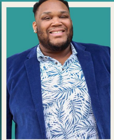
Community Engagement Manager

I serve as the Community Engagement Manager for the Office of Equity and help to make Milwaukee County the healthiest county in the state of Wisconsin.