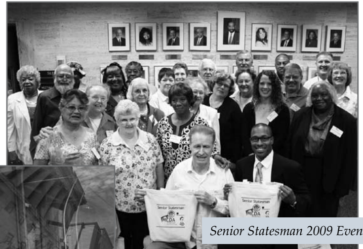
Senior Statesman 2009 Event