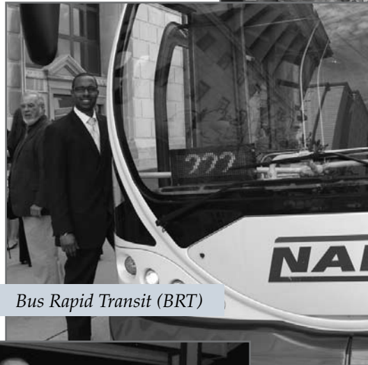
Bus Rapid Transit (BRT)