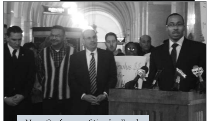
News Conference - Stimulus Funds