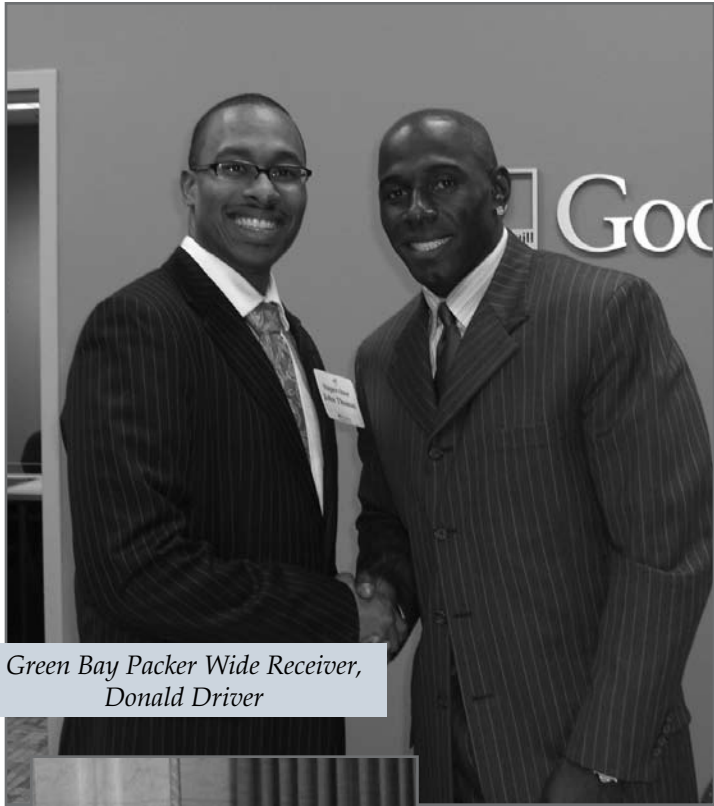
Green Bay Packer Wide Receiver, Donald Driver