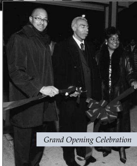
Grand Opening Celebration