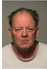
Schwichtenberg – DUI-3 rd

Milwaukee, WI – Acting Sheriff Richard Schmidt ordered increased Labor Day weekend Drive Sober patrols beginning on Friday, September 1, through Tuesday, September 5 at 6:00 a.m. The initiative focused on keeping the public safe through increased traffic enforcement.