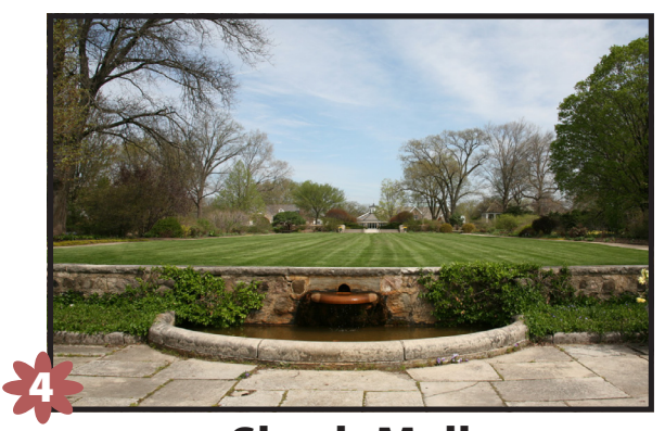
Shrub Mall Suited for groups of 200 persons or less The long grassy mall is bordered by an extensive planting of shrubs, annuals and perennials.