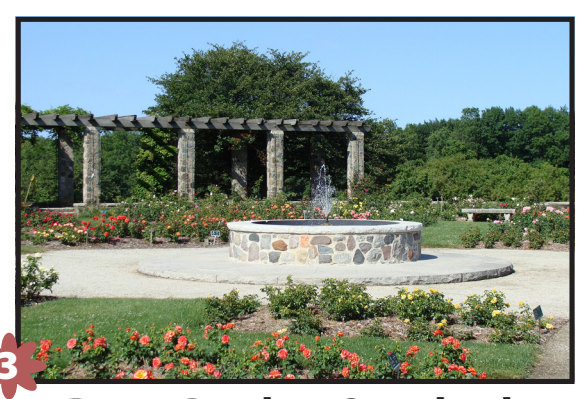
Rose Garden Overlook Suited for groups of 80 persons or less The garden features over 3,000 rose plants with an impressive stone-and-wood arbor backdrop.