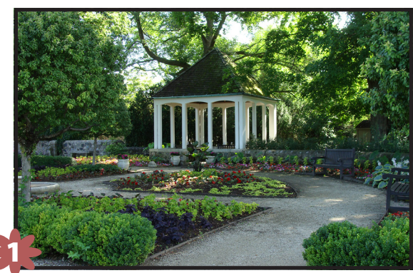
Annual Garden & Gazebo Suited for groups of 30 persons or less The historic gazebo and garden walls come alive with a colorful a variety of flowers.