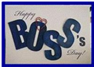
National Boss's Day – October 16 th